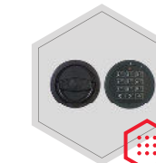
Electronic lock (Excl. 20000-20001)