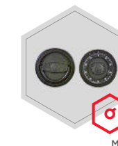
Mechanical code lock