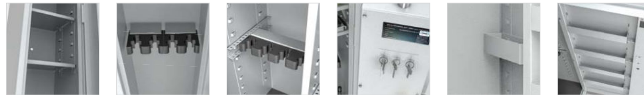
Adjustable shelf Adjustable rifle holders on magnets (foam holder gauge 55mm) Adjustable rifle holders on rail (foam holder gauge 65mm) Hook bar Storage boxes Storage boxes on door