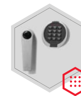
Electronic lock Primor 3000 level 15