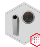
Electronic lock Solar Basic