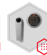
Electronic lock Solar Business