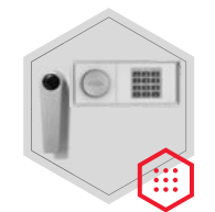
Electronic lock B 30 (Excl. 413100.00)