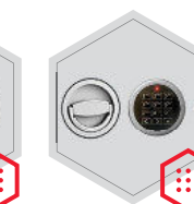
Electronic lock with mechanical emergency