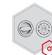
Mechanical code lock