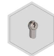
Euro Profile Lock