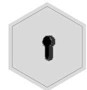
Preparation for Euro Profile Lock