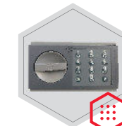
Electronic lock (Excl. 17000-17001)