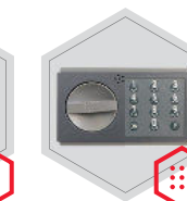
Electronic lock (Excl. 33000-33001)