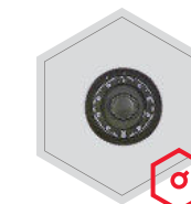
Mechanical code lock (Excl. 33000)